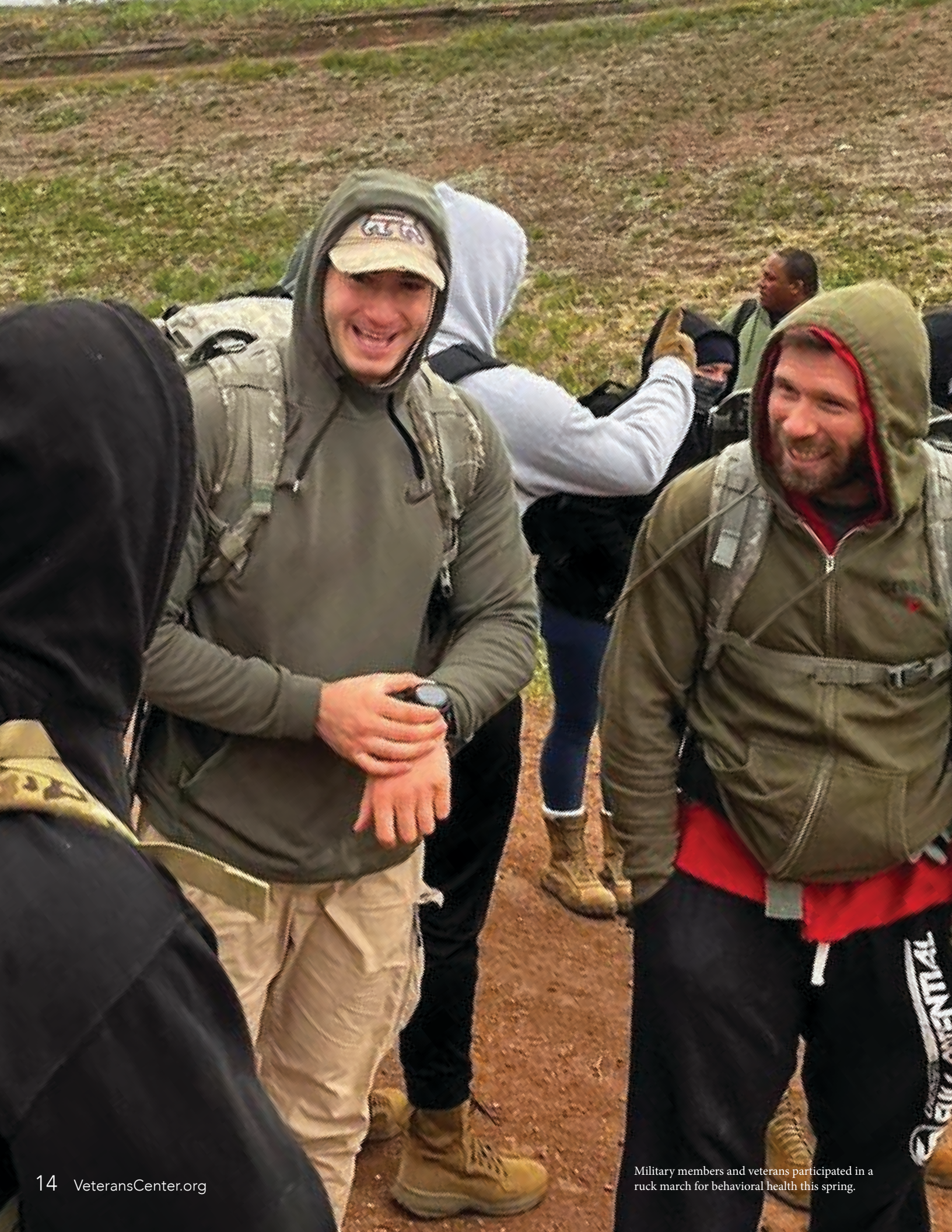
Military members and veterans participated in a ruck march for behavioral health this spring.