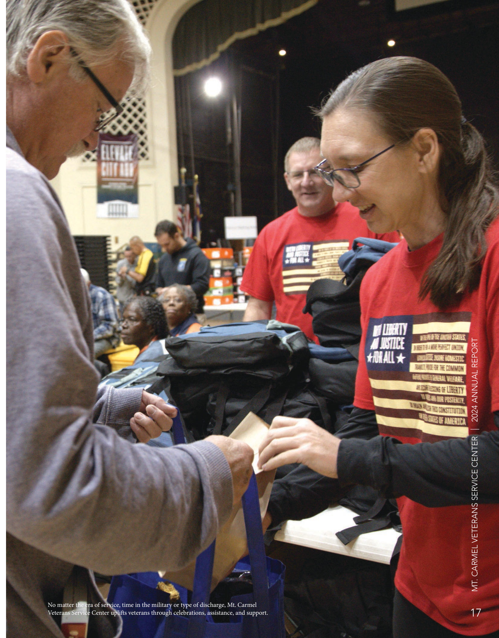
No matter the era of service, time in the military or type of discharge, Mt. Carmel Veterans Service Center uplifts veterans through celebrations, assistance, and support.