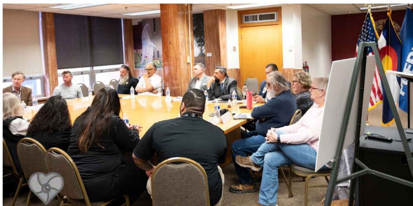
Senator Hickenlooper Round Table with Pueblo Veteran advocates.

In January, we also had the opportunity to meet with Senator Hickenlooper and Congressman Hurd, providing updates on veteran affairs and highlighting the impact of our programs in the community. These meetings reinforced the importance of local and federal collaboration in supporting veterans and their families.